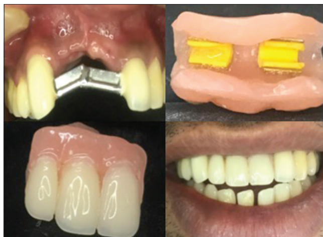
Figure 3: Final cementation of porcelain fused to metal fixed partial denture and the removable pontic assembly of Modified Andrew's Bridge