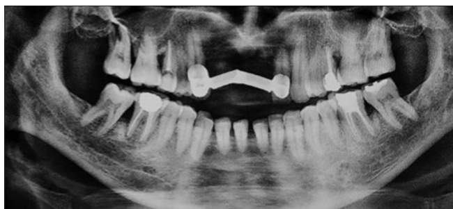
Figure 2: Postoperative panoramic radiograph 36 months after surgery. Note the radiographic bone fill at the distal roots of permanent maxillary second premolars, and permanent mandibular first molars

adopted for their prosthetic rehabilitation. These include implant-supported fixed dental prosthesis with onlay grafting and guided bone regeneration. However, this may not only be expensive and unpredictable but may also have an extended period of treatment. The modified Andrew's bridge prosthesis uses a removable prosthesis which is retained by a bar and sleeve attachment on their intaglio surface to fixed retainers and has favorable stress distribution to the abutments. [10] Limited reports of the failure of such prosthesis are found in the literature, [9] which were mainly attributed to soldering failures.