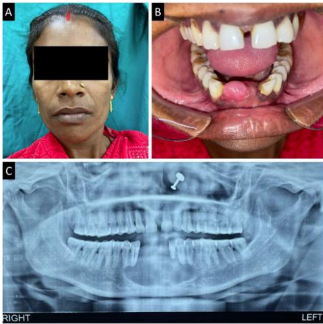
Fig. 1: A: Extraoral frontal profile of the patient; B: Diffuse swelling with sessile growth in the mandibular anterior region; C: Orthopantomogram showing a well-defined multilocular lesion.

A 31-year-old female presented to the institutional department with an asymptomatic swelling in the mandibular anterior region. The swelling had gradually increased in size over the course of the past two years, swelling in the lower front tooth region of the jaw for 2 years. During this period, three of her mandibular incisors had also spontaneously expelled out from the socket. No history of trauma or medical condition was elicited from the patient. The patient's general examination and vital parameters were unremarkable. No gross asymmetry or enlarged lymph nodes were found on the extraoral observation of the patient.