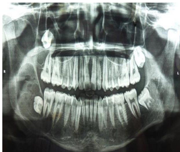
Fig. 4: OPG revealed a large well defined, corticated, unilocular radiolucency in the right body and ramus region with impacted right mandibular third molar and radiolucent lesion in the right maxillary tuberosity with impacted maxillary right third molar

investigations were done, an incisional biopsy was taken & histopathological findings were suggestive of dentigerous cyst for which enucleation was considered as a treatment option, under local anaesthesia crevicular incision was given in right first molar extending posteriorly with the distal releasing incision towards the external oblique ridge, buccal flap reflected and the cystic lesion was exposed cystic lining removed. Lower right third molar which was embedded in cystic lining was removed, margins smoothed and suturing was done with 3-0 vicryl. Healing was uneventful.