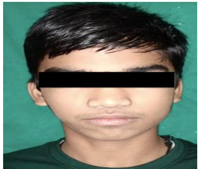
Fig. 1: Extra oral picture

appeared to be scalloped, thinning of lower border of mandible was seen (Fig. 2). On aspiration it showed straw coloured fluid. Provisional diagnosis was dentigerous cyst with a differential diagnosis of OKC (odontogenic keratocyst), radicular cyst. Complete investigations were carried out. Histopathological findings of incisional biopsy was suggestive of dentigerous cyst, so the patient was planned for enucleation of cystic lesion under local anaesthesia. Patient was scrubbed & draped in routine manner. Left inferior alveolar nerve block & buccal infiltration was given with 2% lignocaine with adrenaline. Cervical incision was given buccal flap was reflected, the cystic lining & cystic content were exposed. Third molar was removed and entire cystic lining and cystic content was enucleated (Fig. 3). Interrupted suture was given. Follow up was done after 7 days, 15 days, 1 month up to 2 years no recurrence of cyst was evident.