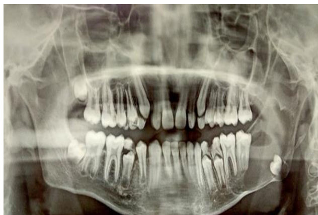
Fig. 2: OPG showed unilocular radiolucency from left second molar to left sigmoid notch with impacted left lower third molar