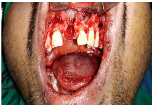
Fig. 6: Surgical exposure of cystic lesion