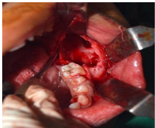
Fig. 3: Intraoperative photograph showed enucleation of cystic lesion with removal of lower left impacted third molar