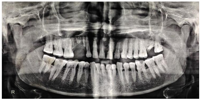
Fig. 5: Digital panoramic radiograph showed irregular radiolucency with loss of normal trabecular pattern at the region of upper first & second pre-molar