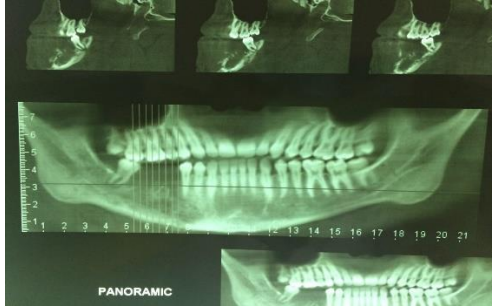
Fig. 2: Digital reconstructive panoramic radiograph showed irregular radiolucency with loss of normal trabecular pattern at the region of lower first & second pre-molar